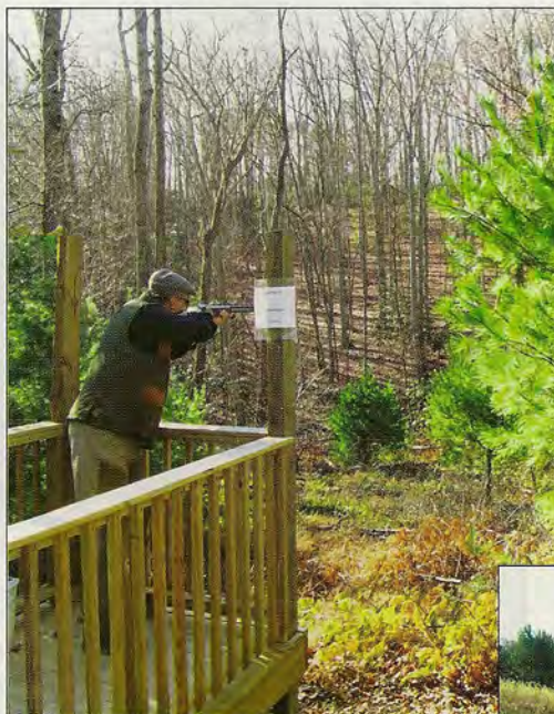
Primland offers excellent clay shooting and upland hunting amid Virginia's Blue Ridge Mountains.

We started our day in a sorghum field with my Lab, Luke. Now, hunting with your own dog, which Primland allows, is fun when things go well but frustrating when they do not. The birds we were after weren't waiting around to be flushed, and when they decided to fly they got up fast and strong. Let's say my dog and I